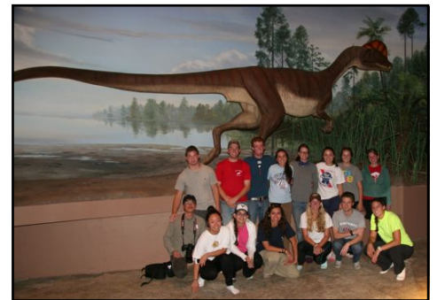
EES 334, Geosphere Structure and Evolution class visiting Dinosaur State Park in Connecticut