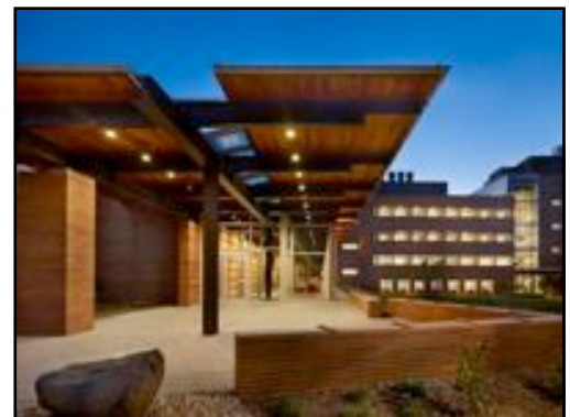
STEPS Building, home of the EES Department