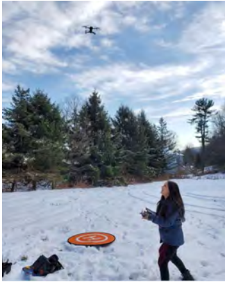
Mariah Matias flying drone "LUEESA" at Island Beach State Park, NJ March 2020