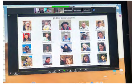
2020 EES Seniors